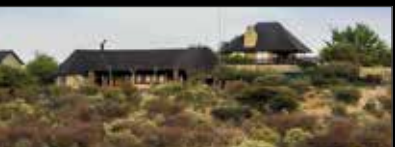
VAT tax on accommodation