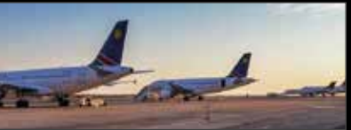
Transport cost to Namibia