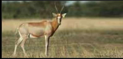
Blesbuck - Yellow: POR