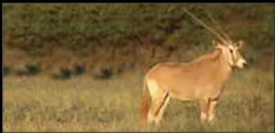
Gemsbok - Golden: US$ 3,500