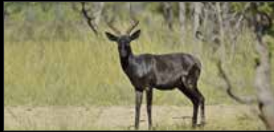
Impala - Black: US$ 2,500