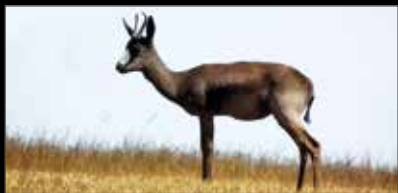
Springbok - Black: US$ 950