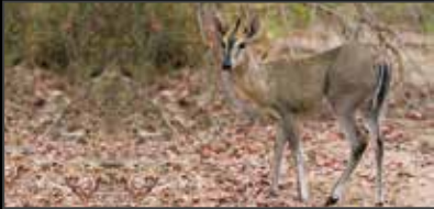
Duiker: US$ 450