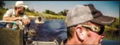
Insurance of any kind