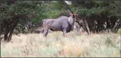
Eland: US$ 3,500