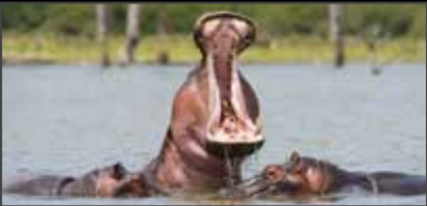
Hippo: US$ 12,500