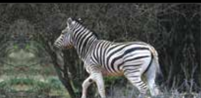
Zebra - Burchell: US$ 1,150