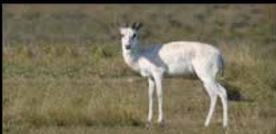
Springbok - White: US$ 1,800