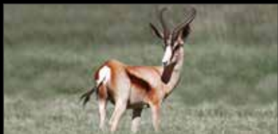
Springbok Copper U$ 1,250