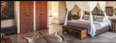
Accommodation at any of Omujeve Hunting Safaris lodges or camps