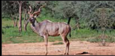
Kudu - Southern Greater: US$ 3,500