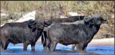
Cape Buffalo: US$ 18,500