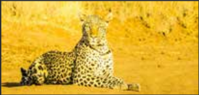
Leopard: US$ 15,000