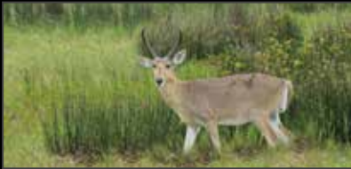
Reedbuck: US$ 2,500