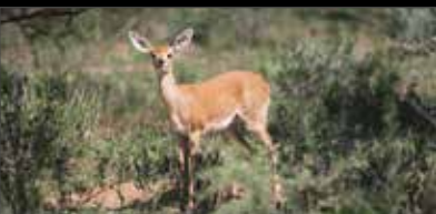
Steenbok: US$ 500