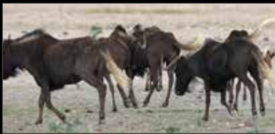
Wildebeest - Black: US$ 1,750