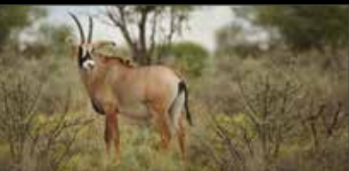
Roan: US$ 8,500*