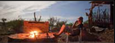
International phone calls