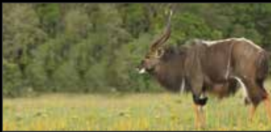
Nyala: US$ 4,500