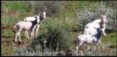
Blesbuck - White: US$ 1,250