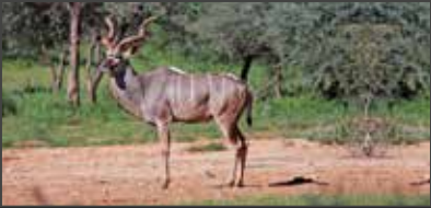
Kudu: US$ 3,500