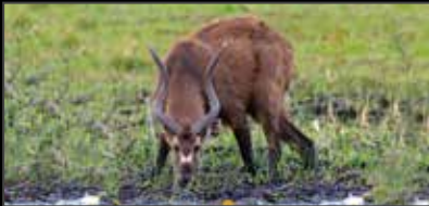
Sitatunga: US$ 25,000