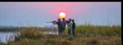
Trophy fees for game taken or wounded