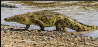
Croc: US$ 12,500