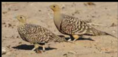
Game Birds: US$ 25