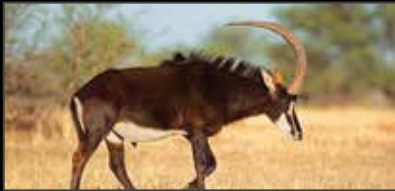
Sable: US$ 9,500