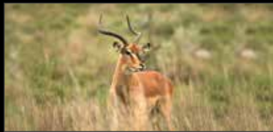
Impala - Black Faced: US$ 1,500