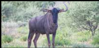
Wildebeest - Blue: US$ 900