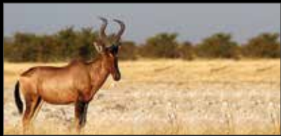
Red Hartebeest: US$ 950