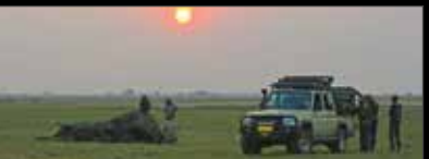
VAT tax on cull animals