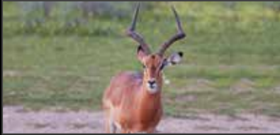
Impala: US$ 595