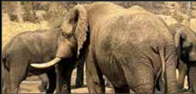
Elephant - Trophy: US$ 45,000