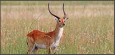
Lechwe: US$ 3,500