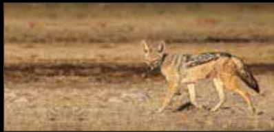
Black-backed jackal: US$ 0