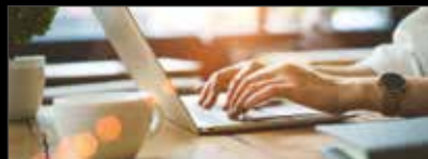
Wi-Fi connection at Omujeve Lodge