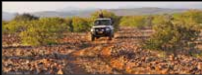
Hunting vehicles & transport to and from airport