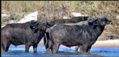
Cape Buffalo: US$ 9,500