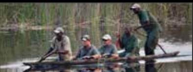
Gratuities to staff