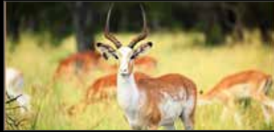
White Flank Impala: US$ 4,500