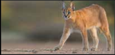
Caracal cat: US$ 1,200