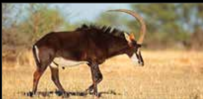
Sable: US$ 6,000*