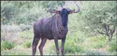
Blue Wildebeest: US$ 900