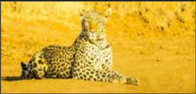
Leopard: US$ 15,000