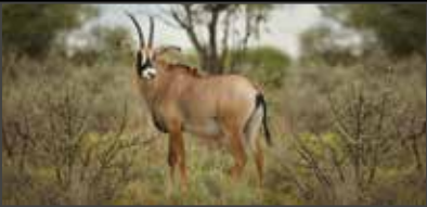
Roan: US$ 12,500