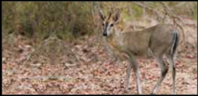
Duiker: US$ 450