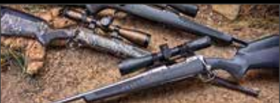
Rifle rental and ammo