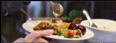
All meals and local beverages, wines, spirits and beers