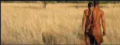
The services of a hunting guide, trackers and skinners