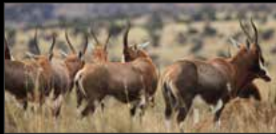
Blesbuck - Common: US$ 850