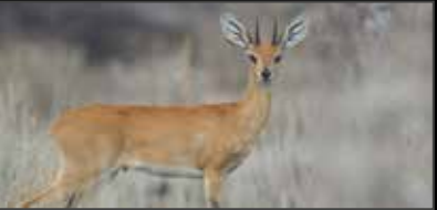
Steenbok: US$ 450