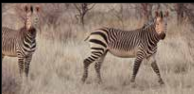
Zebra - Hartmann: US$ 1,500