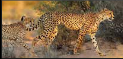
Cheetah: US$ 12,000