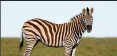
Chapamnn Zebra: US$ 2,500