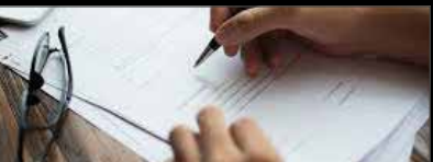
Permits required by any country but Namibia