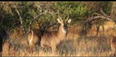
Waterbuck: US$ 1,750