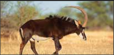
Sable: US$ 9,500