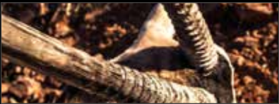
Field preparation of trophies