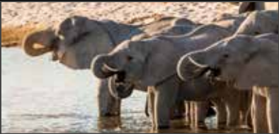
Elephant - Non Trophy: US$ 9,500