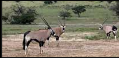
Gemsbok - Kalahari: US$ 850