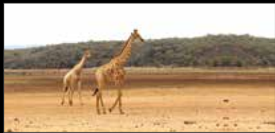
Giraffe: US$ 4,000