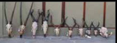
Taxidermy, dip & pack fees and shipping of trophies