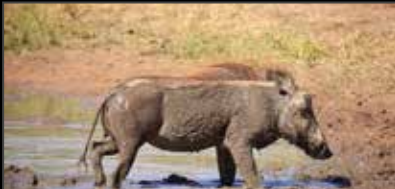
Warthog: US$ 450