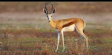
Springbok - Kalahari: US$ 550