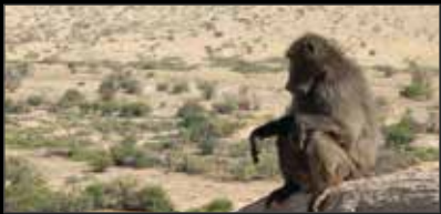
Baboon: US$ 250