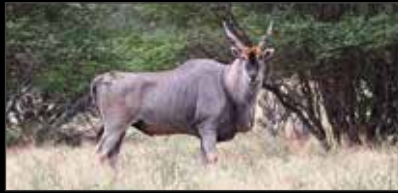
Eland - Cape: US$ 2,850