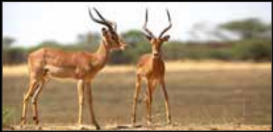
Impala - Common: US$ 650