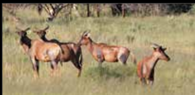
Tsessebe: US$ 4,000*