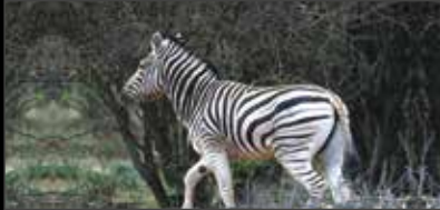
Zebra - Burchell: US$ 950