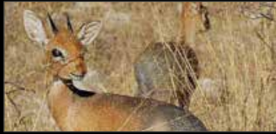
Damara Dik-Dik: US$ 2,500