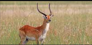
Lechwe: US$ 3,500