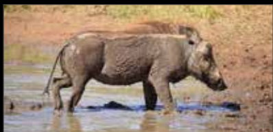
Warthog: US$ 500